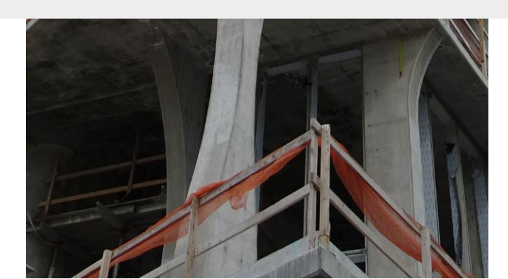
Denver • Seattle • San Francisco • Pasadena • Orange County • Dallas • Atlanta • New York SATELLITE: Portland • San Diego • Phoenix • Houston • Chicago • Boston • Washington, D.C. • Nashville • Orlando • Miami

We help clients understand their projects' complexities, so they can make more informed decisions and, ultimately, mitigate their risk.